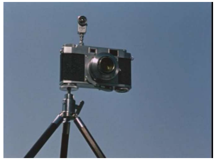
Figure 8a. The camera automatically fixes its subject in place.

sky system. And she poses before a still camera with an automatic timer. So the camera is what we see first, and its movement to capture the "reality" of the young girl as a sociomythic subject position operates on its own, ineluctably, it is merely the duty of Yuko to hold that pose (Figure 8a and 8b).