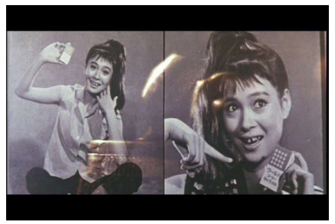
Figure 2a. The "Shima Kyoko" of the World Caramel Ad Campaign.

Ironically, the persona she acquires is a cynical cabaret performer and in her song and dance number she embodies the predatory capitalism that had fictionalized her and provided her the means to refictionalize herself (Figures 2a and 2b).