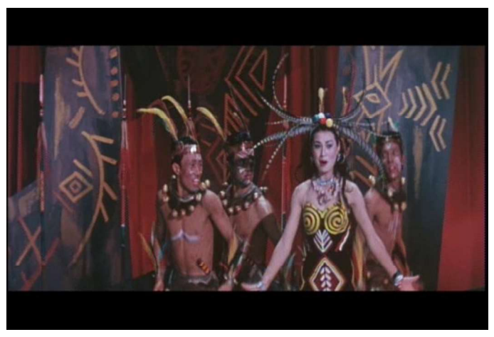
Figure 2b. The "Shima Kyoko" of her own ad campaign.

In "Playgirl" (1963), Masumura presented a more complex portrait of such a subject in Mori Mariko (Taki Eiko), a young woman who guarded her virginity while changing her appearance and personality for each of twenty prospective husbands while keeping elaborate notes on each of them (Figure 3).